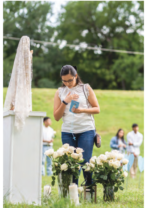
A young woman places a rose at the feet of a statue of Our Lady of Fatima.

Has been appointed Chancellor , without prejudice to his status as General Counsel, effective July 1.