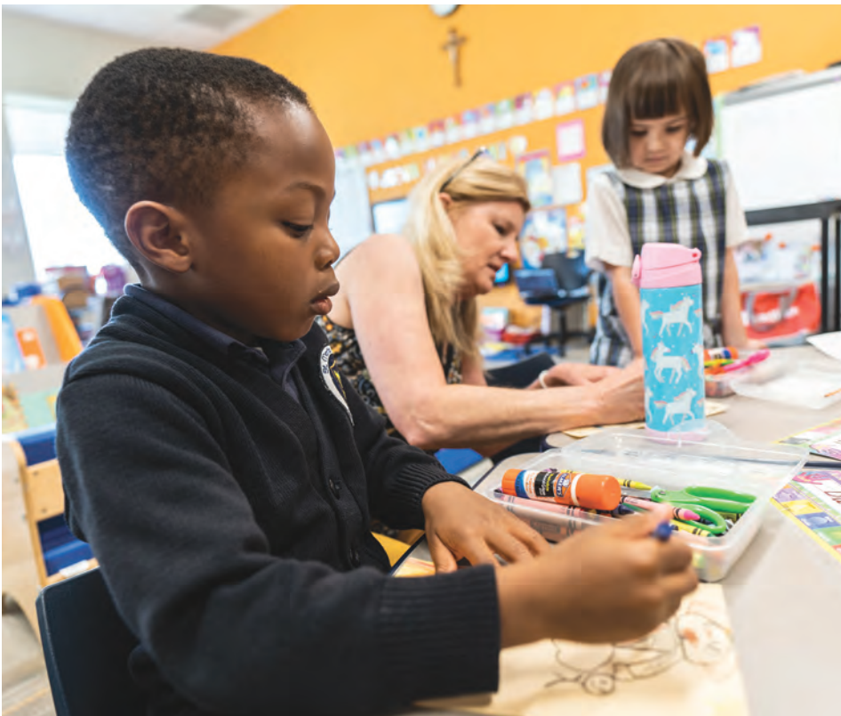
A preschooler works on artwork depicting the Ascension of Jesus on May 15 at St. Martin de Porres Catholic School.