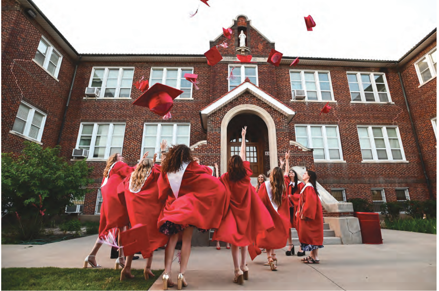
Graduates of Sacred Heart Catholic High School celebrate in this 2022 photo.

from 159 to 365 in her five years of leadership at the school, which moved to its current location in 2017 after opening in The Colony in 2012.