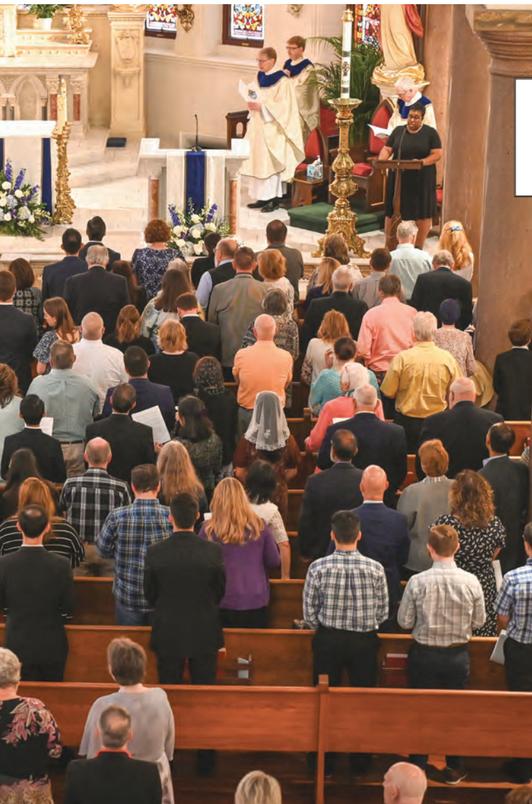
The congregation sings the Litany of the Saints as the ordinands lie prostrate.