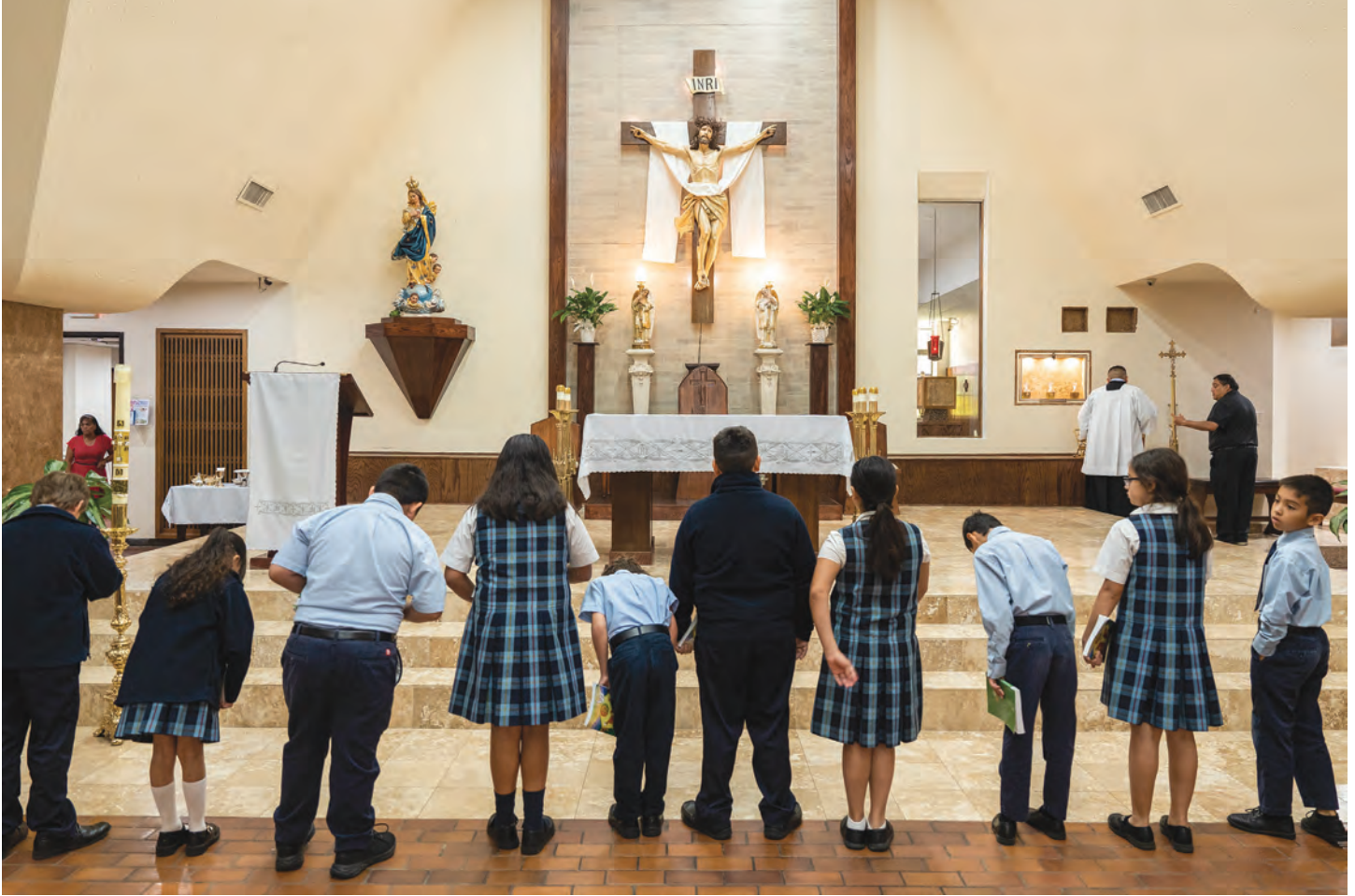
All Saints students bow and make the sign of the cross before the altar at All Saints Church during a school Mass on May 17.