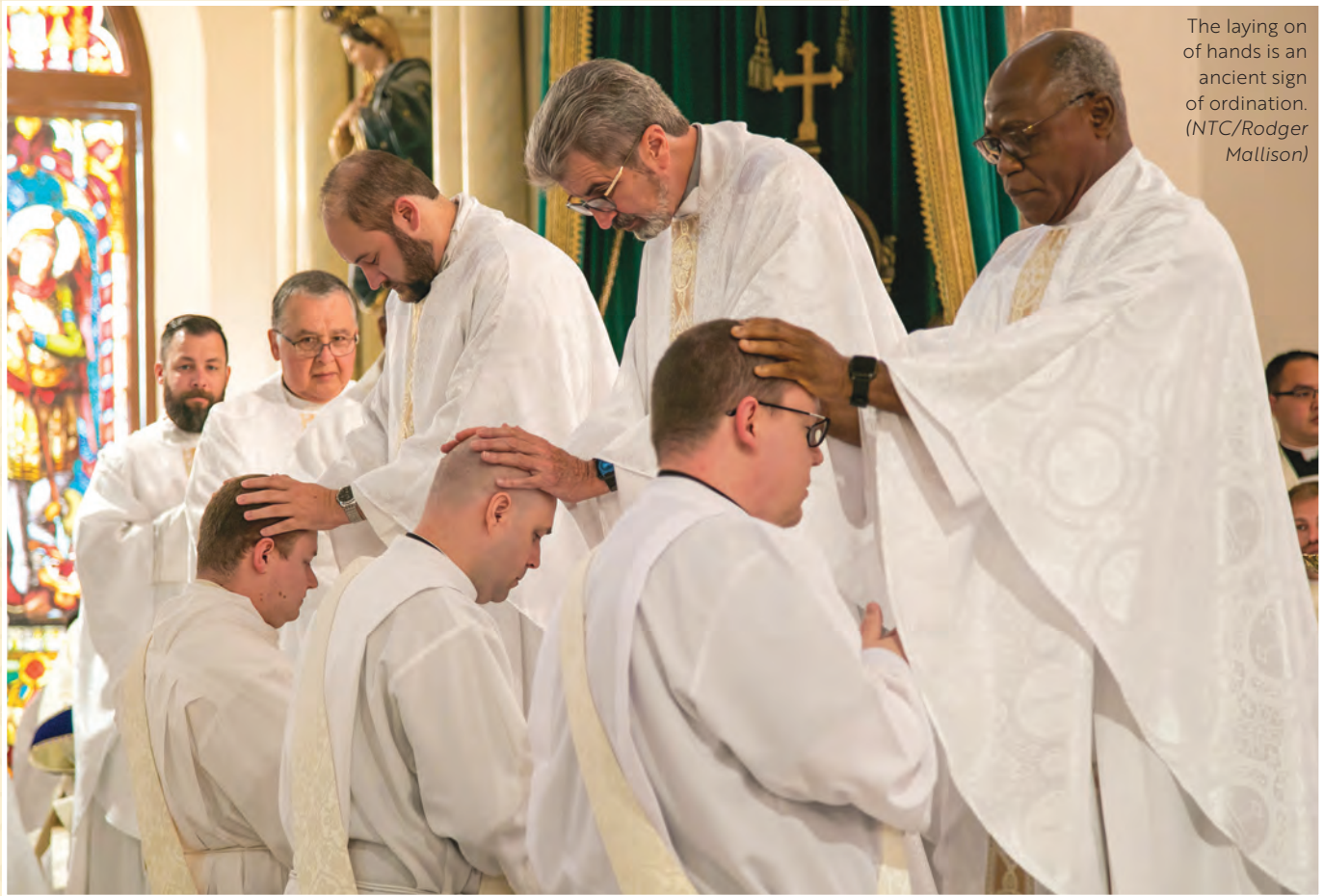
The laying on of hands is an ancient sign of ordination.