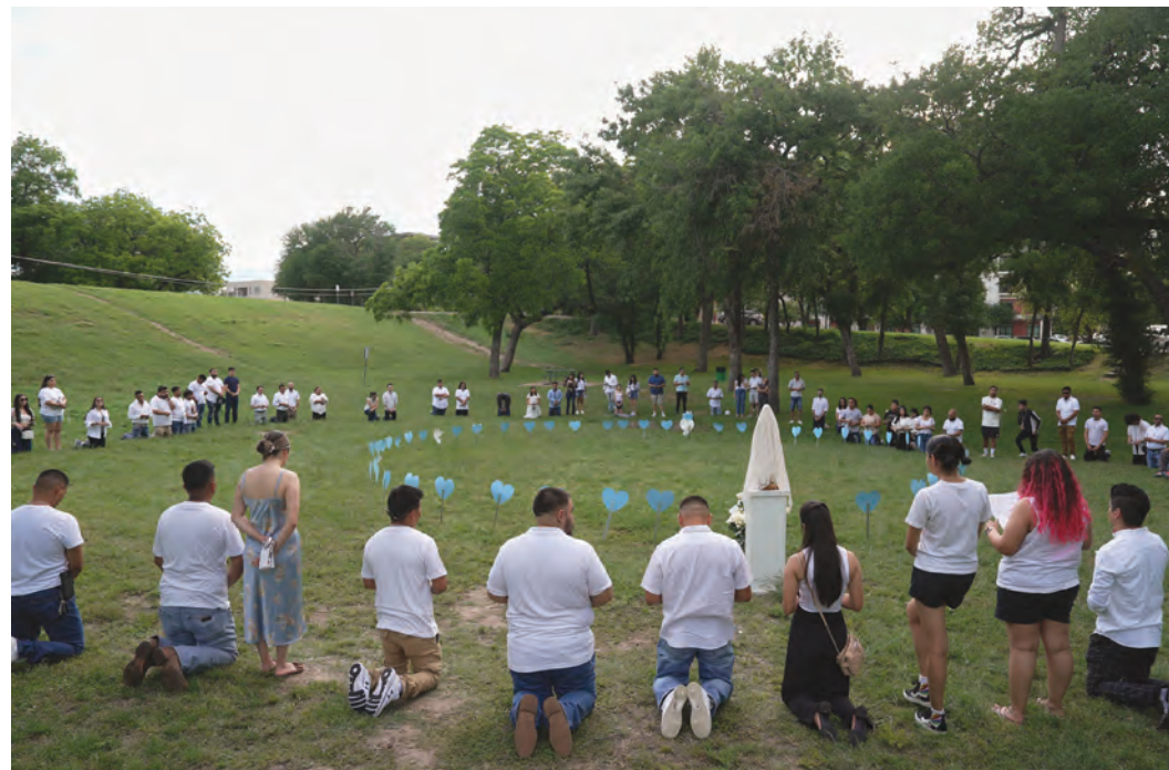
Jóvenes adultos de la Pastoral Juvenil Hispana participan en un Rosario por la Paz y la Unión Familiar el 13 de mayo de 2023 en Trinity Park en Fort Worth. Cien jóvenes adultos asistieron al evento, que se celebró en la Fiesta de Nuestra Señora de Fátima.

La Pastoral Juvenil Hispana de la Diócesis de Fort Worth, organiza diferentes eventos cada mes. Para obtener más información sobre futuros eventos visite: fwdioc.org/pastoral-juvenil-hispana-en . 🇺🇸